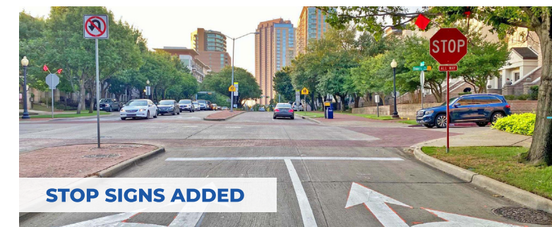
STOP SIGNS ADDED

Uptown Dallas Inc. recently planted more than 14,000 fresh flowers throughout the medians to keep Uptown beautiful.